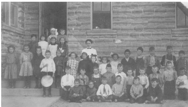
Grade School Children in front of the school, c. 1912

In 1895 the Academy was destroyed by fire, supposedly caused by some chemicals left in the laboratory. Since there was now a high school in town, the Academy was not rebuilt.