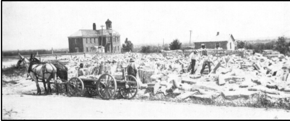
Stone cutting and piles of native limestone rock used to build the 1897 school.

A modern two-story structure was built on the hill above Glen Elder in 1887 as a public school, for attendance by both grade and high school students. It was known as one of the grandest buildings in the country and from the top of the building could be seen both Cawker City and Beloit. Then in 1917 a new building for the high school was constructed across the street east of the Christian Church on the corner of Hobart and Allen St. Elementary students continued to use the old structure until 1937, at which time a new grade school was built on Nash Street. The school on the hill was torn down in 1938. In turn, Ernie Norris used some of the stone in other construction.