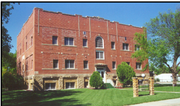
Glen Elder High School, constructed 1917

The Glen Elder "Bearcats" served their school and town well, as they not only had a full education schedule, but were active in sports, speech, drama, music, woodworking, and many other activities, leading their school on to victory. The grade school continued in the building on the hill until 1938 when a new building was constructed a block north of the high school.