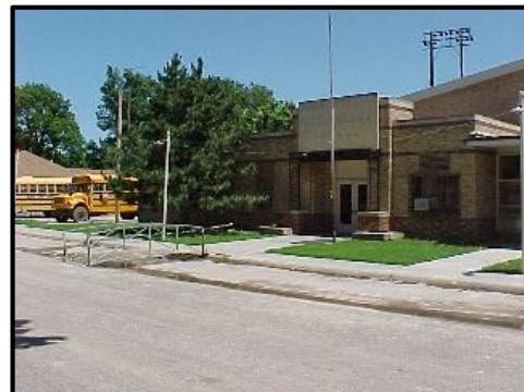
Glen Elder Grade School & Jr. High

Glen Elder High School and Glen Elder Grade School ceased to exist in the spring of 1971. That same spring Cawker City Schools also closed. In the fall of 1971, the two town's schools unified and became the Waconda East Vikings.